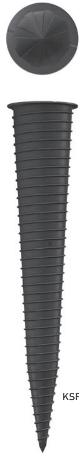
KSF K 60x800