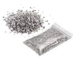
Special Granulate 500 g Item No. 21823