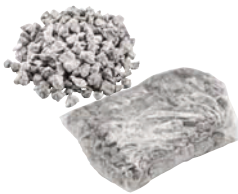
Special Granulate 1500 g Item No. 21824